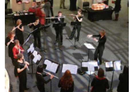
Performing in the Jack Singer Concert Hall lobby before the Gala Concert.

For the Royal Canadian College of Organists, he has served as Centre President (Calgary), Regional Director (Prairies), Chair of the Competitions Committee, as a member of the Education, Professional Support, and Membership and Brand Committees, as a Travelling Clinician, and as an Examiner for the practical and written portions of the College's organ examinations.