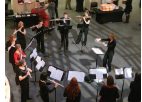
Performing in the Jack Singer Concert Hall lobby before the Gala Concert.

For the Royal Canadian College of Organists, he has served as Centre President (Calgary), Regional Director (Prairies), Chair of the Competitions Committee, as a member of the Education, Professional Support, and Membership and Brand Committees, as a Travelling Clinician, and as an Examiner for the practical and written portions of the College's organ examinations.